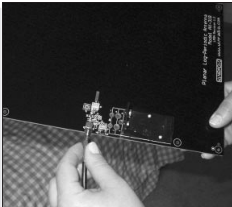
Connecting the supplied six-foot cable to the antenna. The other end terminates in a BNC connector — perfect for your scanner.

Much of my listening fare is aircraft — Newark International airport is only a few miles north. My regular antenna is a discone mounted on a pole near the top of our two-story house. Much of the time, as with many antennas, it pulls in signals — it is after all an omnidirectional antenna — from all over. Guess what? I've found a new, near-perfect — and indoor — antenna with the WiNRADiO antenna! Signals from the tower came in loud and clear. Disconnecting the antenna I changed to a rubber duck and heard nothing. I then switched to a telescoping whip antenna and was able to hear some transmissions from the