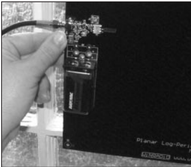
A small switch turns on the antenna, activating a small red LED.

“Its construction — even though it’s designed for indoor use only — is high quality throughout.”